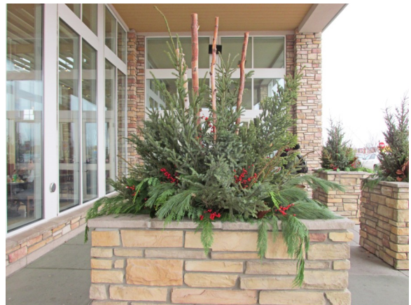
Outdoor planter with winter greenery