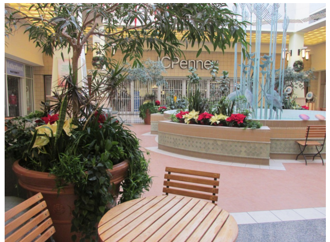
The fountain area planted for winter